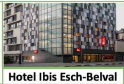
Hotel Ibis Esch-Belval