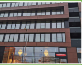
Appart Hôtel Residhome Esch-Belval