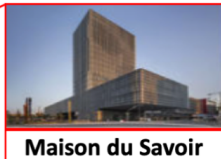
Maison du Savoir